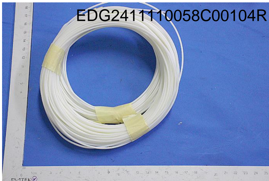
样品照片 Sample Photo

Test results are only responsible for delivered samples. This test report is issued by the company and is intended for your exclusive use. This test report includes all of the tests requested by you and the results thereof based upon the information that you provided. You have 30 days from data of issuance of this test report to notify us of any error or omission caused by our negligence. A failure to raise such issue within the prescribed time shall constitute your unqualified acceptance of the completeness of this report, the tests conducted and the correctness of the report contents.